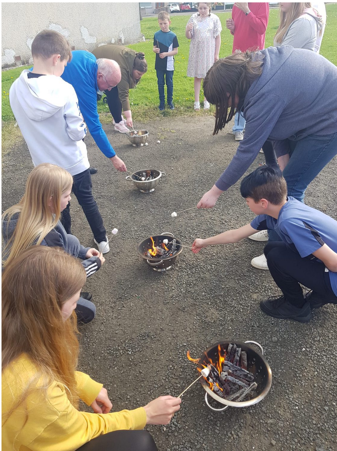
Toasting marshmallows at Templehall & Torbain Messy Church!

Did you know there is a Fife Presbytery Messy Church Facebook Group? It's a great place to share ideas and find inspiration for messy church and similar activities. You can find it here: