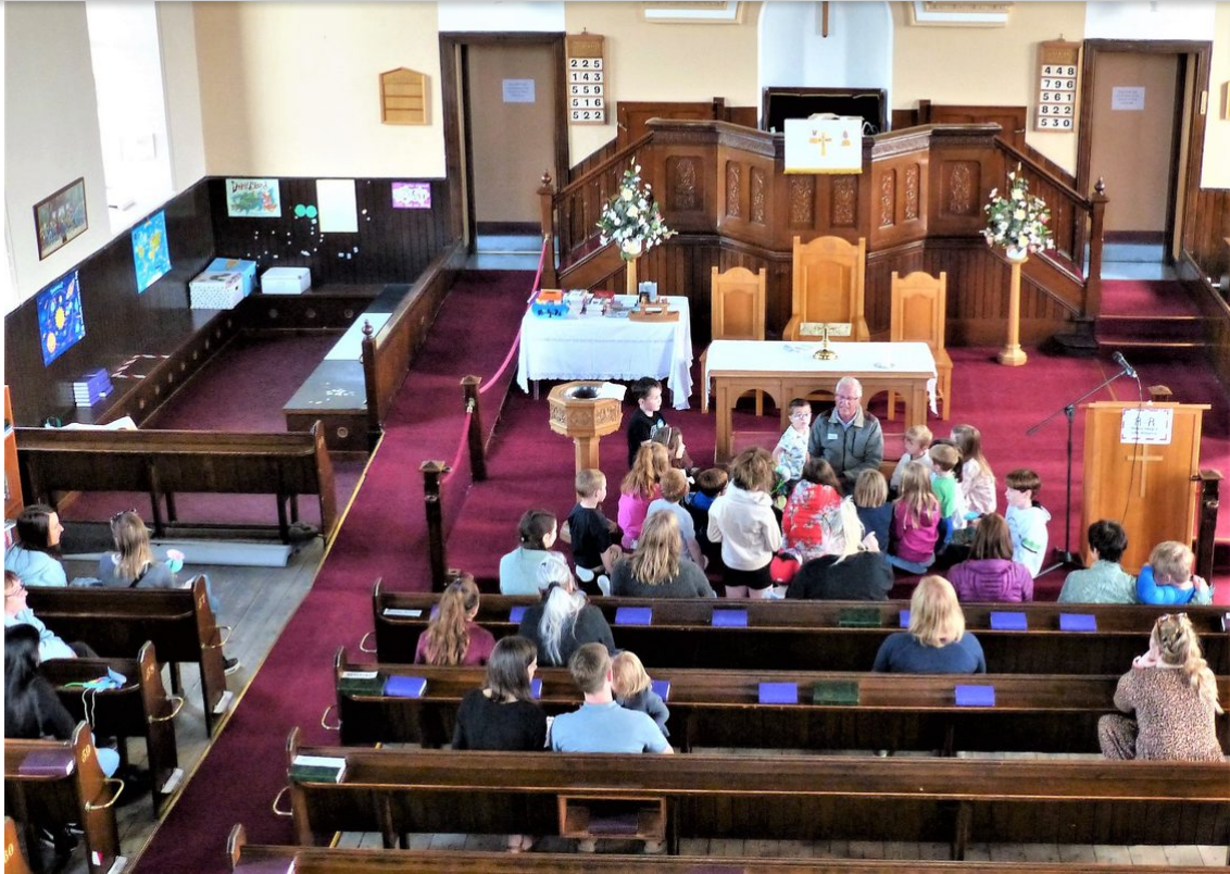
Everyone’s listening to the story at Townhill & Kingseat Messy Church